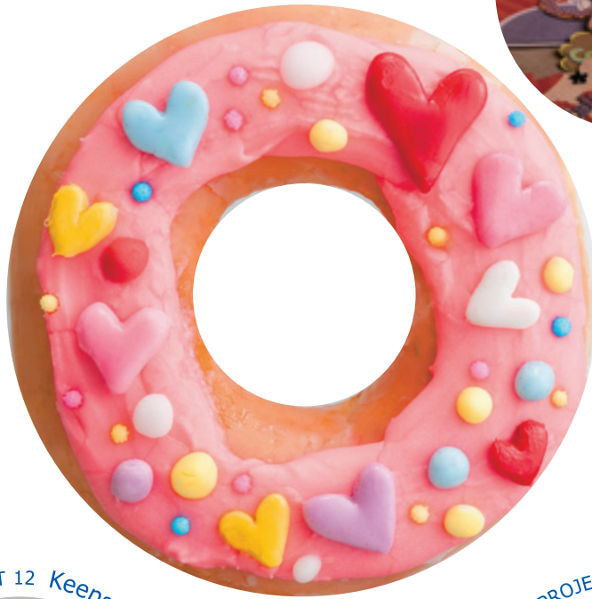
PROJECT 12 Keepsake Box page 25