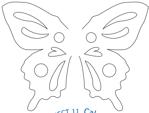
PROJECT 11 Calendar page 23