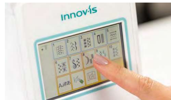
Colour LCD touchscreen