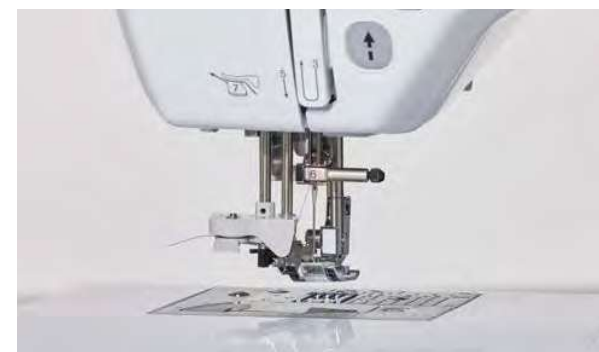
Advanced needle threader