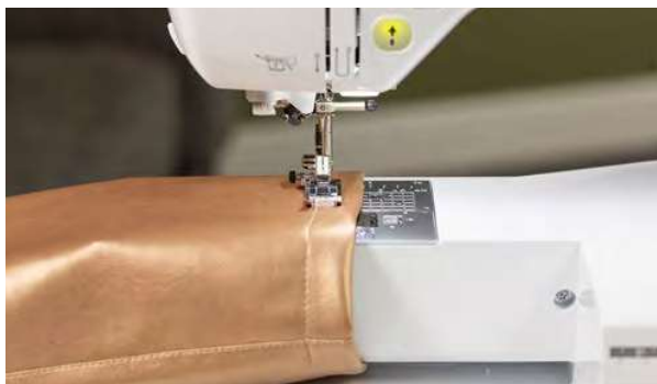
Free arm sewing