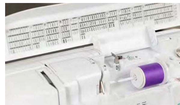
241 built-in sewing and decorative stitches